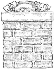
Our Santa Pull-Up Pocket with the insert card fully enclosed.

Our two-sided Pull-Up Pocket rubber stamps create pockets filled with coordinating insert cards that can be "pulled up" to reveal fun designs! Use Pull-Up Pockets to hold gift cards, candy, photos, and other small treats. Or use them as greeting cards, gift tags, invitations, announcements, and more!